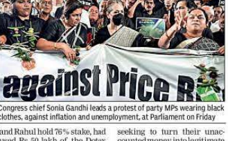
Congress chief Sonia Gandhi leads a protest of party MPs wearing black clothes, against inflation and unemployment, at Parliament on Friday