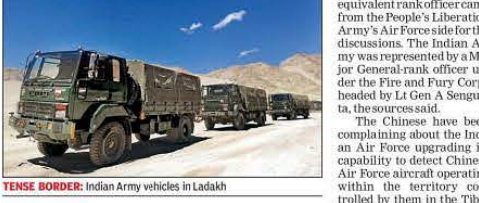
TENSE BORDER: Indian Army vehicles in Ladakh

New Delhi: India and China held a special round of military talks earlier at the Chushui-Moldo border meeting in eastern Tibet to discuss air space violations and provocations by the Chinese side in that area in the last 45 days. The talks were held after the Indian Air Force sternly countered the Chinese attempts to provoke in the Eastern Ladakh sector by violating air space and the confidence-building measure lines which mandate that both sides should fly fighter planes within 10 kms of the LAC. During the military talks, the Indian side strongly raised objections over the Chinese flying activities near eastern Ladakh sector for over a month now and asked them to avoid such pro-