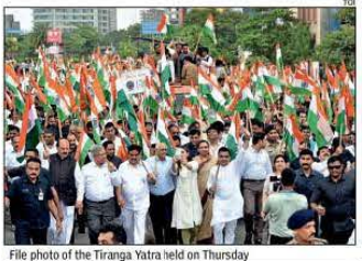
File photo of the Tiranga Yatra held on Thursday

He Was Standing With Firearm Near Dais TIMES NEWS NETWORK