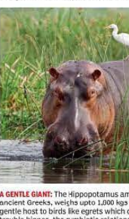
A GENTLE GIANT: The hippopotamus amphibius, termed the 'river horse' by ancient Greeks, weighs up to 1,900 kg and grows 16 feet long...