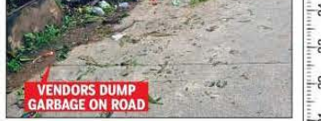
Residents of Ramneshnagar in Hyderabad are troubled over an open area in their vicinity turning into an absolute garbage dump, adding to the woes the litter is even attracting Tagnors, and poll strategist Pigs. Also, an open drainage in the colony has led to a viral fever outbreak. The place stinks and yet no action is being taken by the GHMC.