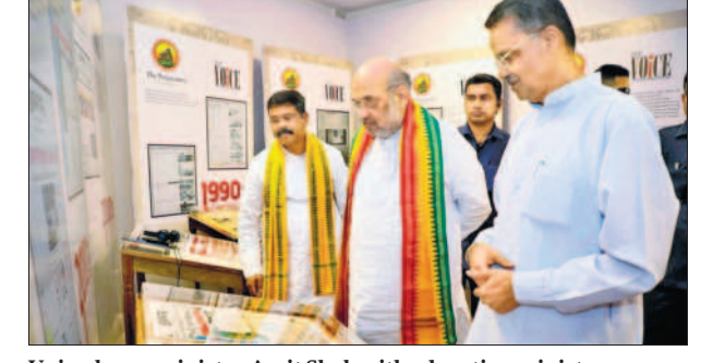
Union home minister Amit Shah with education minister Dharmendra Pradhan in Cuttack on Monday

Modi started politics of performance and achievement instead of dynastic politics.