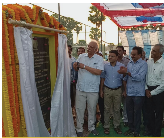
Tennis Court at Vizianagaran district