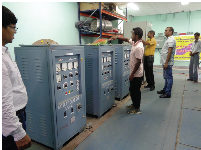
Cleaning of equipment under 'Swacchta Abhiyan'