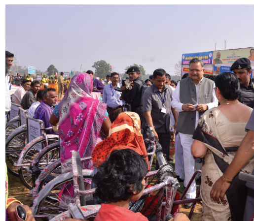
Distribution of aids and appliances to person with disabilities