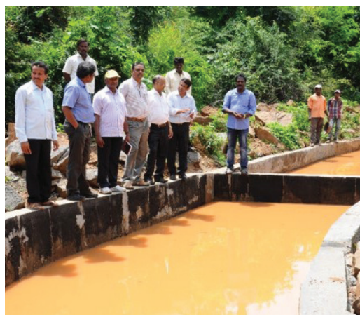
Waste Water Treatment for cultivation at Bethemcherla Mandal