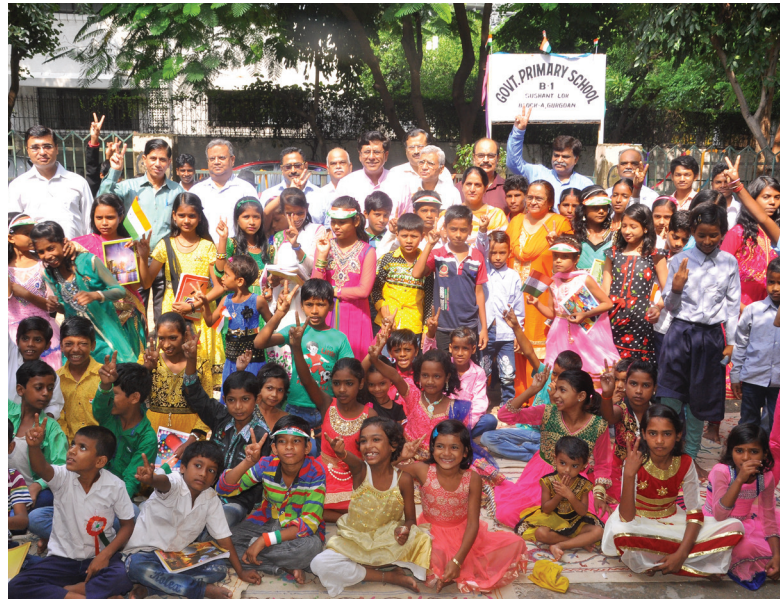
Supply of desk and benches at Govt. Schools